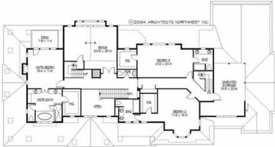
UPPER FLOOR - PLAN M6575A4S-0 UPPER FLOOR: 2875 S.F. UNDEVELOPED STORAGE: 560 S.F.