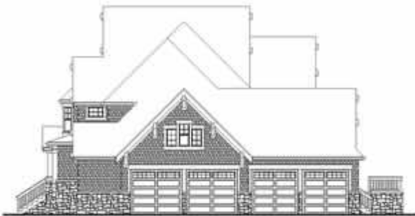
RIGHT ELEVATION - PLAN M6575A4S-0