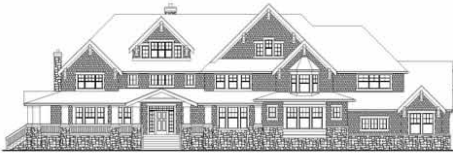
FRONT ELEVATION - PLAN M6575A4S-0