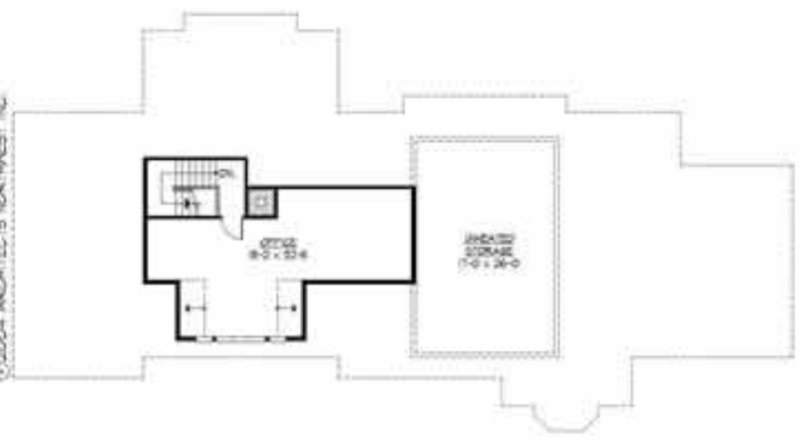
THIRD FLOOR - PLAN M6575A45-0 THIRD FLOOR: 484 S.F. HEATED STORAGE: 480 S.F.